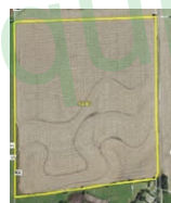
TRACT VI TRACT IN N1/2 E1/2 SE1/4 36-31-1W 30 th Ave N/MERIDIAN (TRACT III ON THE EAST)