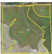
TRACT IV NW 1/4 31-31-1E 40 th Ave N (TRACT V ON THE WEST)