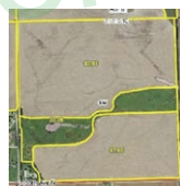
TRACT III SW1/4 31-31-1E 704 E 30 th Ave N (TRACT IV ON NORTH)