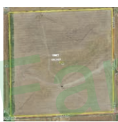
TRACT VIII SE1/4 25-31-2W 40 th Ave N /DRURY RD