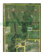
TRACT IX SW1/4 & S1/2 NW1/4 33-31-1W 30 th Ave N / TYLER