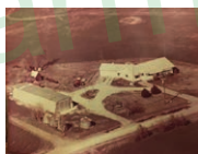
TRACT II SW CORNER SW 1/4 31-31-1E 702 E 30 th Ave N