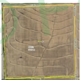
TRACT I NE1/4 30-31-1E SENECA/50 th Ave N

1136 M/L Acres Farmland And Family Home with Outbuildings All near Wellington, Ks Sold in 9 TRACTS